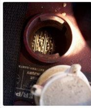
Exposed cells causes rapid sulfation