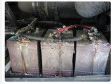
6volts in series and parallel