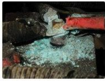
6volt battery severe oxidation close up